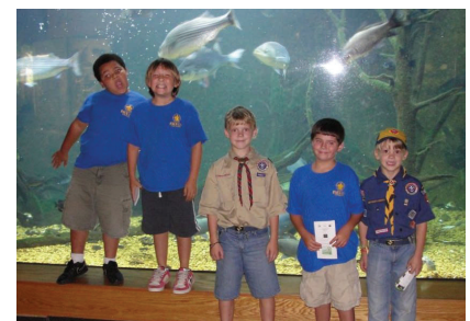
The boys pose in front of the big tank.

After hitting the nature trail and almost losing Ms. Jessica in the aMAZEing Ocean maze, it was time to end the day with a trip to the gift shop!!